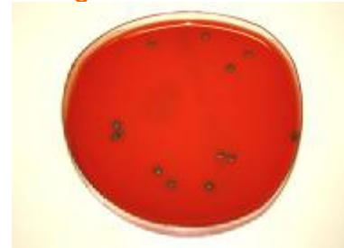
Listeria monocytogenes outgrowth on a laboratory medium

Smartfood research results indicate that using combinations of ingredients that by themselves have no or even an adverse effect on the custard's shelf life, provide shelf life improvement and even inhibit Listeria monocytogenes growth.