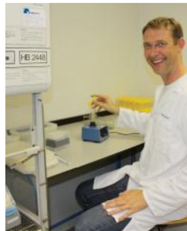
Preparation of microbes for challenge testing